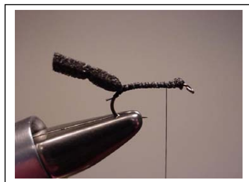
Fig 1 and Fig 2

Post: 1/8 inch diameter closed cell foam dows, Color White