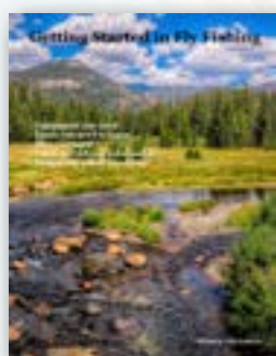
Getting started in Fly fishing 16 page download