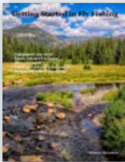
Getting started in Fly fishing 16 page download