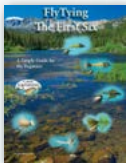
Fly Tying the First Six A Simple Guide for the Beginner