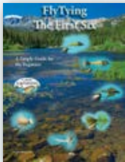
Fly Tying the First Six A Simple Guide for the Beginner