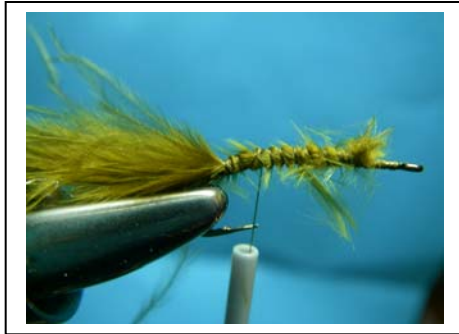
Fig 2 Tie in the marabou and trim to look like the second picture